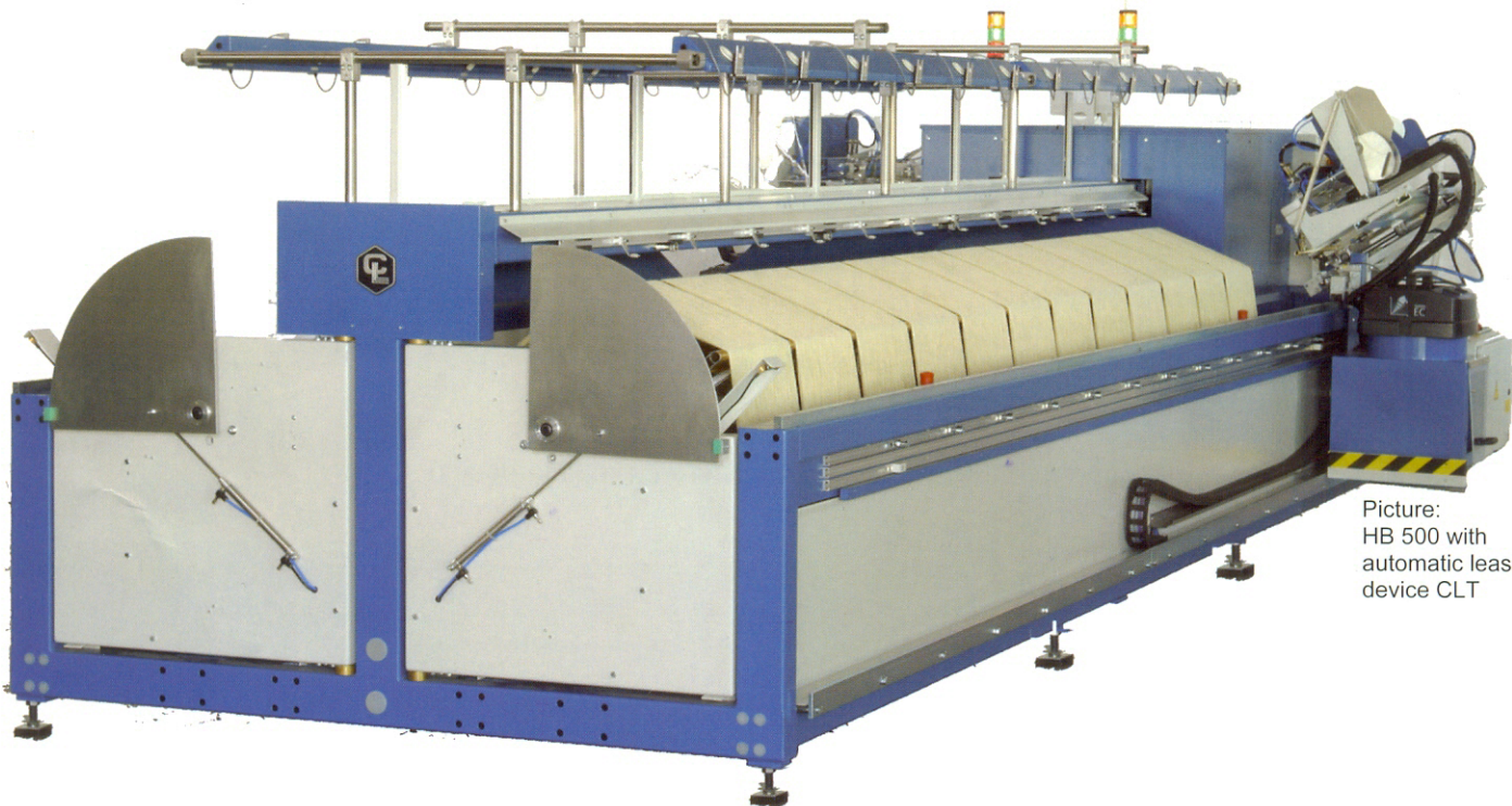
Picture: HB 500 with automatic leasing device CLT